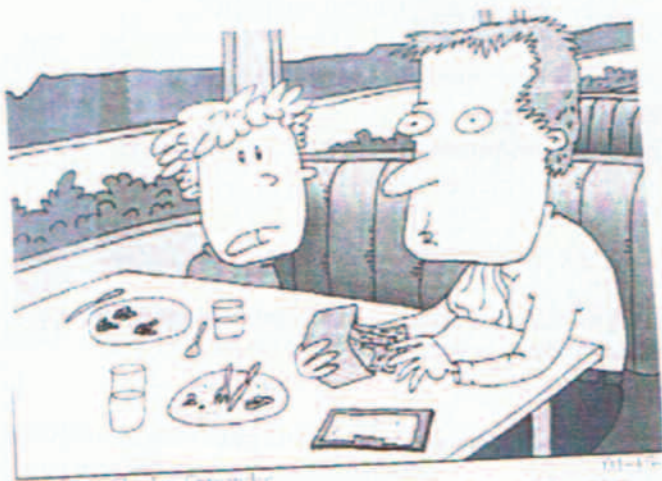
HOW COME THE WAITRESS GETS 15% AND GOD ONLY GETS 10%?